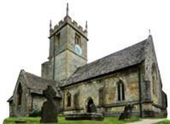
Hampton – Fairfield – Thistledown Eastwick Park – Charity Crescent